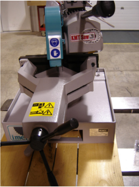
Machine not yet on base