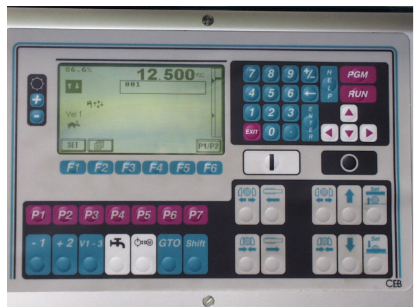
NC Control Panel