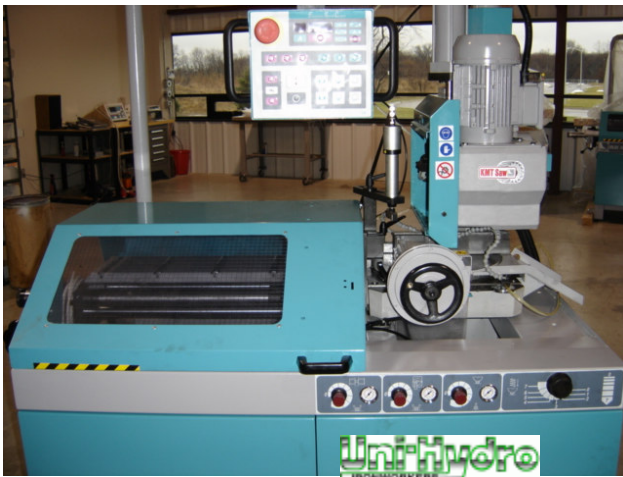
Front of C 370 A