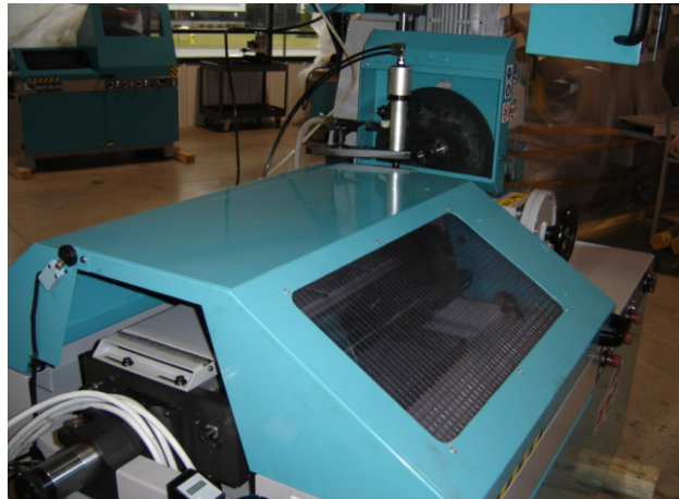
Infeed side of machine