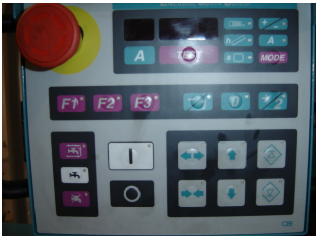
C 370 A control panel