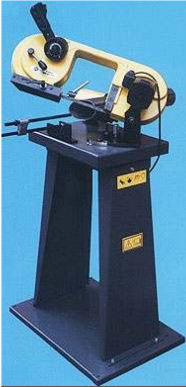
EV 88 shown in mitering position with optional steel base.

Adjustable blade guides allow the user to true up the vertical direction of blade, even when blade is worn.