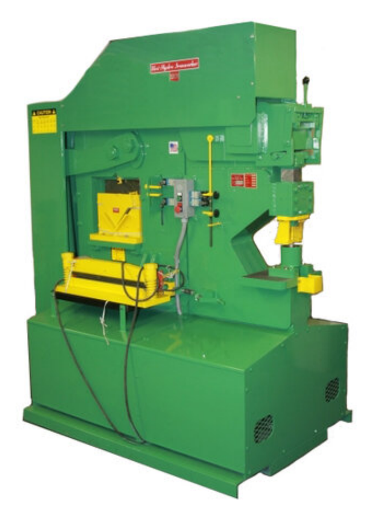
* Shown with optional Slug Type Angle Shear

In the World of Uni-Hydro's immense ironworkers the PRO 150 ton model stands above the rest. These ironworkers are the definition of monstrous, with a reputation for tremendous punching ability given the shear mass of support and design. The separate punch arm can be built with a 12-24" throat and creates so much power, any fabrication job is done with ease.