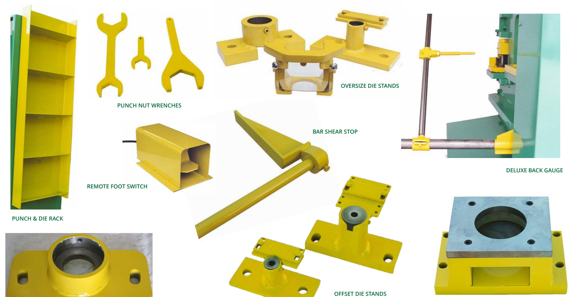
OVERSIZE DIE STAND